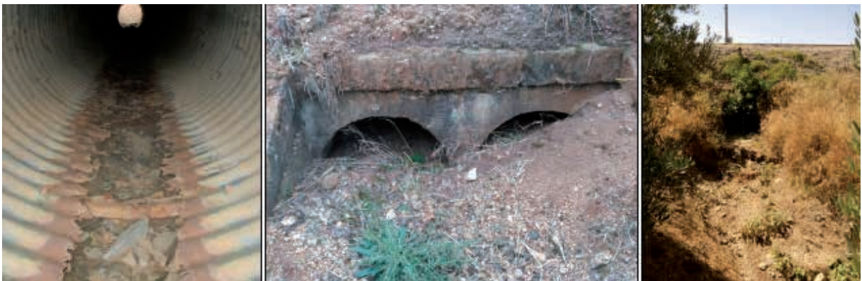
Figure 2. Risk factors examples: structural deterioration of the culvert barrel, partial blockage of the culvert barrel, evidences of substantial erosion at the culvert outlet.