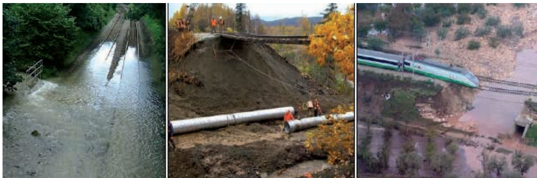
Figure 1. Traffic disruption events caused by culvert failure: overtopping flows and infrastructure collapse.

Although the design of railway culverts is currently subject to national technical regulation: (Ministerio de Fomento, 2015), (Ministerio de Fomento, 2014); maintenance management aspects and evolution of service levels through time are not considered. Experience in other countries (USA, Australia) shows that having up-to-date and detailed information about culvert conditions is crucial when it comes to maintenance management (Federal Highway Administration, 2010) and planning of preventive maintenance activities (Balkham et al., 2010). As many of these structures reach the limit of their service life, management administrations must need to schedule their replacement or repair (Najafi and Bhattachar, 2010), however, currently they do not have an adequate prioritization methodology that help them planning this operations though time, so these operations are often undertaken once the incidence in the service level has occurred (corrective actions).